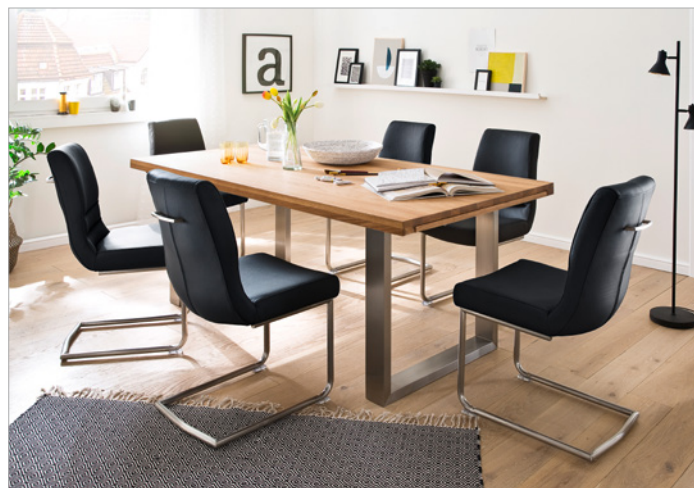
Skid table DAYTON with Cantilever chair MONTERA