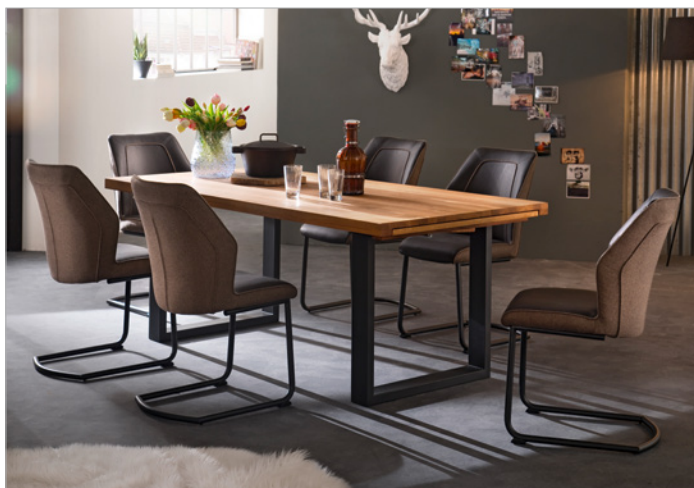
Skid table DAYTON with Cantilever chair ABERDEEN