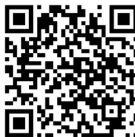
function of the table

... 220 .. W - H - D approx. 220 (320) - 77 - 100 cm