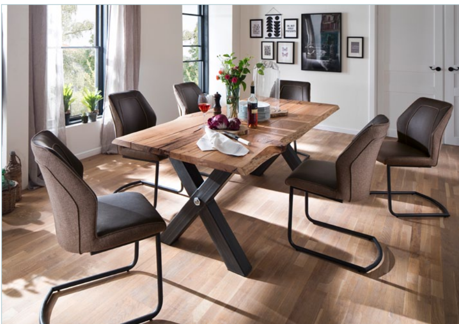
Dining table SAMARA with cantilever chair ABERDEEN

SA124EIW W - H - D appr. 240 - 77 - 100 cm