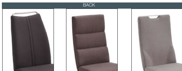
version A with handle