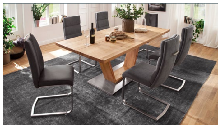
Cantilever chair GIULLIA with dining table GRETA