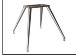
4-leg frame oval, tapered