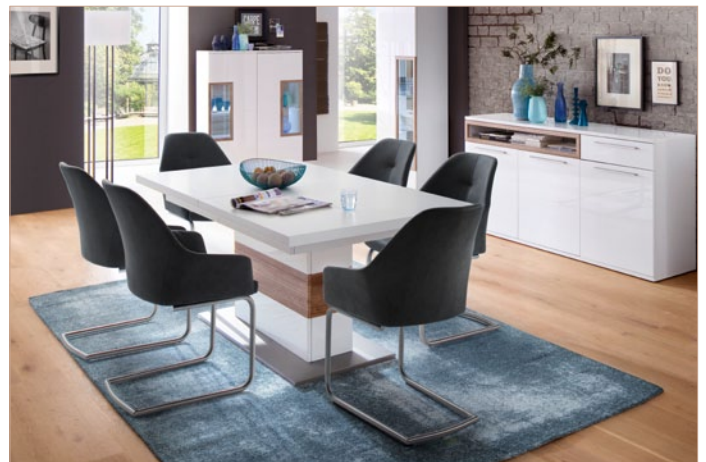
Cantilever chair MADITA with cabinet furniture product line PAMPLONA