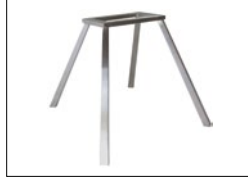
4-leg frame square, tapered