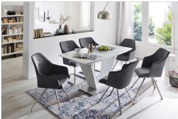
Chair & cantilever chair MADITA with table ILKO

Cantilever chair round tubing brushed stainless steel W/H/D approx. 54/88/62 cm max. load: 130kg PU: 2