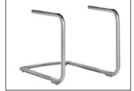
Cantilever chair round tubing