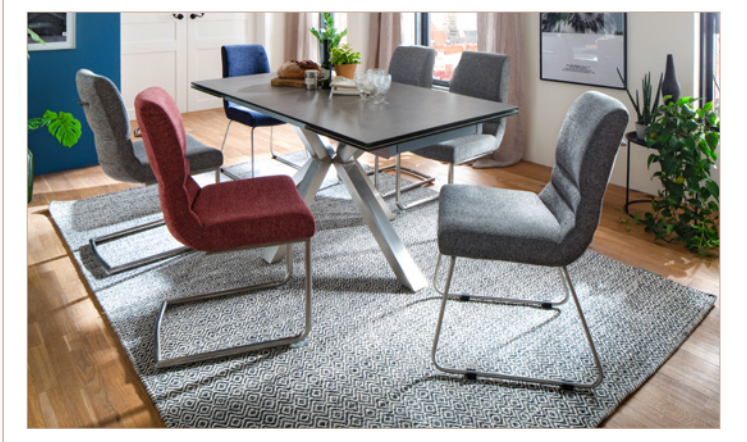
Cantilever and skid chair MONTERA with table NAGANO