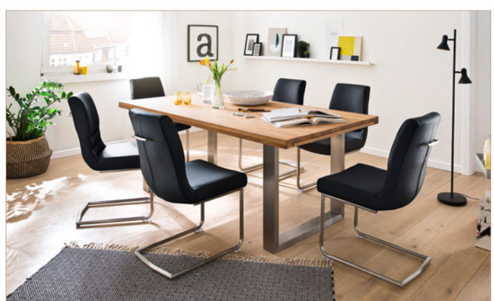
Cantilever chair MONTERA leather with table DAYTON