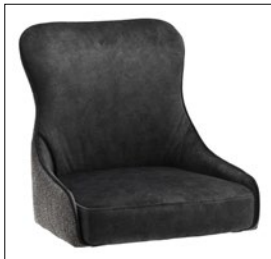
SHEA66 .. Seat A Pocket spring - Luxury comfort seat W/D approx. 53/64 cm PU: 2