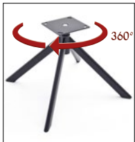
SHGD73SM 4-leg frame oval, black matt lacquered 360° turnable with leveling max. load 120 kg W/H/D approx. 49/36/48 cm PU: 2