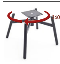
SHGD63SM 4-leg frame round, black matt lacquered 360° turnable with leveling max. load 120 kg W/H/D approx. 46/36/47 cm PU: 2