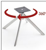
SHGD73EG 4-leg frame oval, brushed stainless steel 360° turnable with leveling max. load 120 kg W/H/D approx. 49/36/48 cm PU: 2