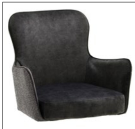
SHEB66 .. Seat B with armrests Pocket spring - Luxury comfort seat W/D approx. 62/64 cm PU: 2