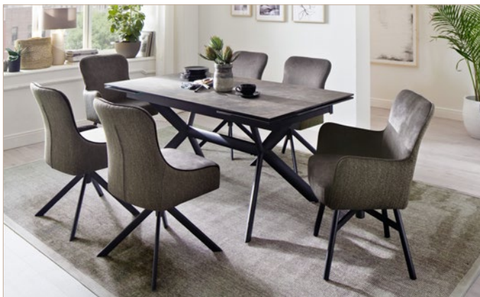
Chair system SHEFFIELD with table SIROS

The specified measurements are approximate; we reserve the right to make technical changes and corrections to the model. Some sketches are not to scale.