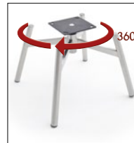
SHGD63EG 4-leg frame round, brushed stainless steel 360° turnable with leveling max. load 120 kg W/H/D approx. 46/36/47 cm PU: 2