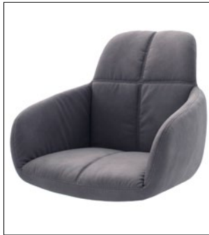
TESE13 .. Finish E W/H/D approx. 62/60/65 cm PU: 2