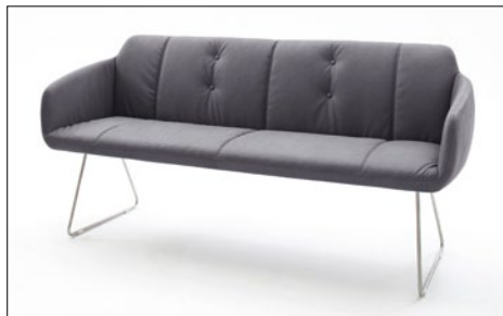
TB . K18 .. Bench with sled base frame W/H/D approx. 180 /85/67 cm PU: 1