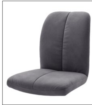
TESC13 .. Finish C W/H/D approx. 46/60/58 cm PU: 2