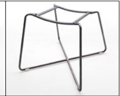
TEGE64AN X-sled base frame Anthracite lacquered W/H/D approx. 52/42/60 cm PU: 2