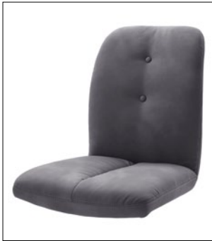
TESA13 .. Finish A W/H/D approx. 46/60/58 cm PU: 2