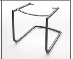
TEGE52AN Cantilever frame, round tubing Anthracite lacquered W/H/D approx. 45/42/58 cm PU: 2