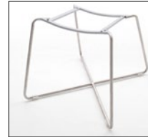
TEGE64EG X-sled base frame brushed stainless steel W/H/D approx. 52/42/60 cm PU: 2