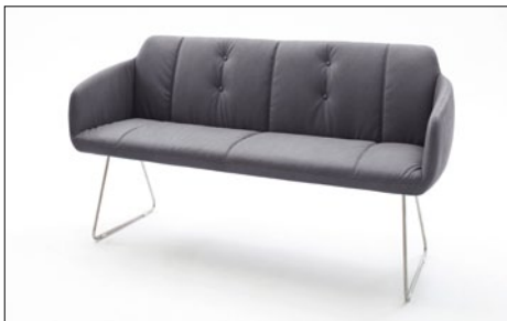
TB . K16 .. Bench with sled base frame W/H/D approx. 160 /85/67 cm PU: 1