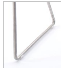
.. E ..... Frame in brushed stainless steel