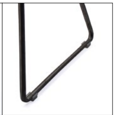
.. A ..... Frame anthracite lacquered