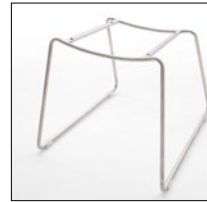
TEGE74EG Sled base frame brushed stainless steel W/H/D approx. 51/41/60 cm PU: 2