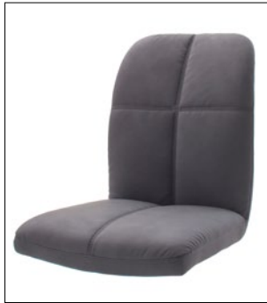
TESB13 .. Finish B W/H/D approx. 46/60/58 cm PU: 2