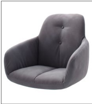
TESD13 .. Finish D W/H/D approx. 62/60/65 cm PU: 2