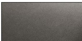
..... GX grey

Cover: Structured look (100% polyurethane)