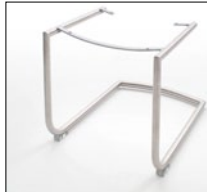
TEGE52EG Cantilever frame, round tubing brushed stainless steel W/H/D approx. 45/42/58 cm PU: 2