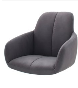
TESF13 .. Finish F W/H/D approx. 62/60/65 cm PU: 2